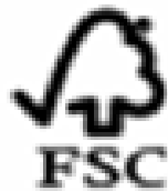
Forest Stewardship Council