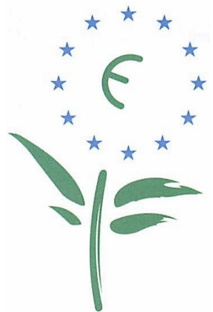
The European Ecolabel