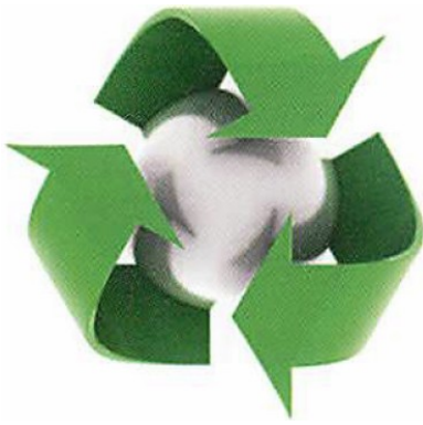
A recycling logo