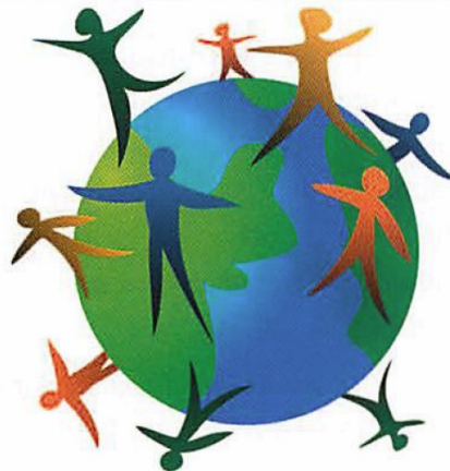
Logo depicting global unity